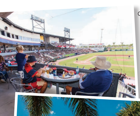
Cool Today Park, North Port