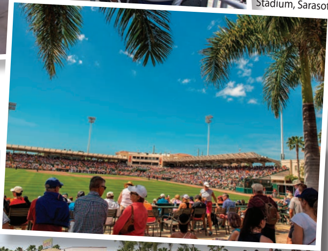
Ed Smith Stadium, Sarasota